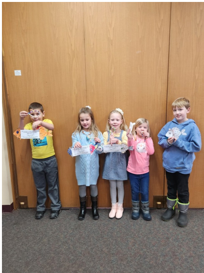
← Fishers of Men Craft