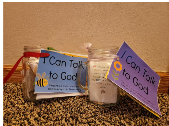
Prayer Jars →