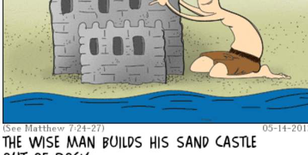
(See Matthew 7:24-27) 05-14-2012

THE WISE MAN BUILDS HIS SAND CASTLE OUT OF ROCK